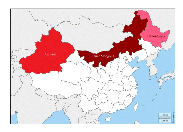
Chart 2: China's major sugar beet production areas by province