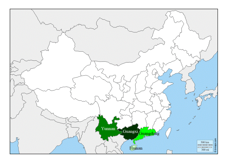
Chart 1: China's major sugar cane production areas by province